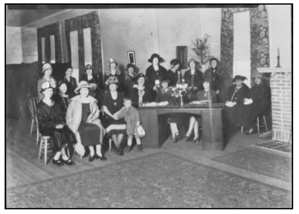
Members of the Hope Hull Woman's Club, date unknown

tual improvements, social intercourse, and civic betterment. Pink and lavender were chosen as club colors and dues were set at $1.00 a year. The group also voted to join the General Federation of Women's Clubs as well as the Alabama Federation of Women's Clubs. The Alabama group was organized in 1895 and was chartered into the General Federation of Women's Clubs in 1907. These groups promote education, preserving natural resources, stress good citizenship, moral and spiritual values, and good health, contributing to world peace and international understanding and supporting participation in the arts. At various times